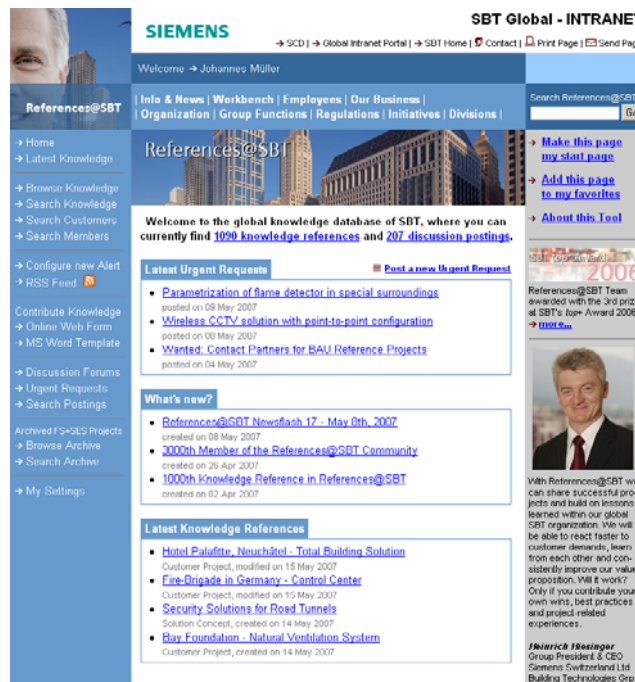
Fig. 1. Homepage of References@SBT, where recent urgent requests, news announcements, and knowledge references are dynamically displayed.

Some weeks after the initial prototype was available on the Siemens intranet, the other divisions of SBT realized the benefit of such an application for their own business needs. After some relatively minor adaptations, the application could be extended for group-wide and cross-divisional use in mid-2005. In October 2005, the application was named References@SBT and became an integral part of the official 'Global SBT Intranet'.